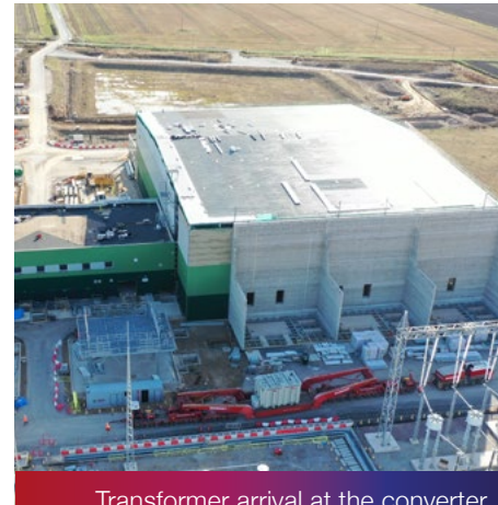
Transformer arrival at the converter station site