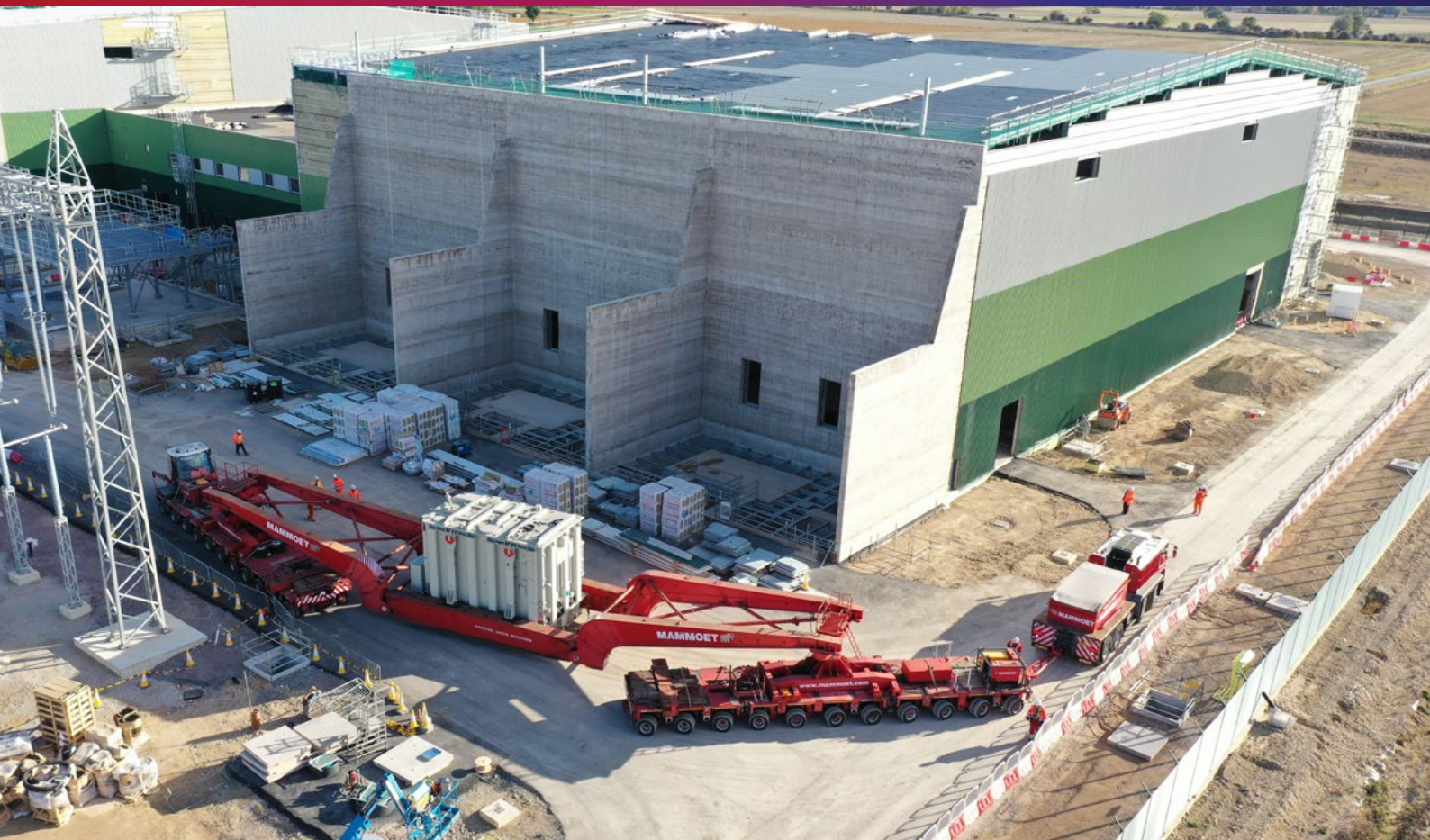
Viking Link's converter station site, Bicker Fen, receiving its first delivery of a transformer.