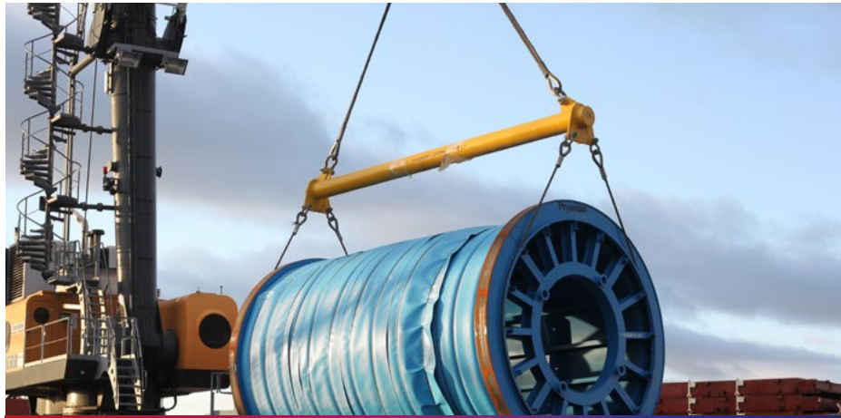
Unloading cable drums