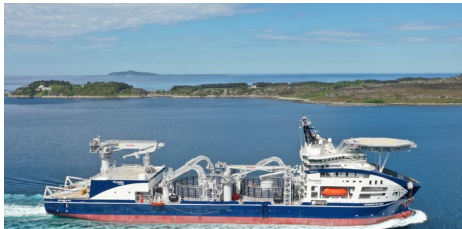
Leonardo da Vinci vessel laying cable