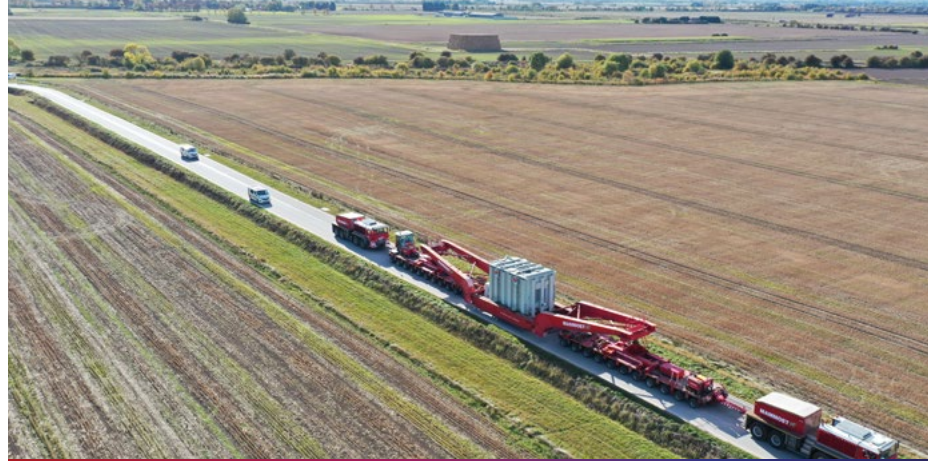
Transformer delivery to site