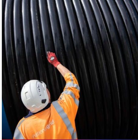
Onshore cable drum

Viking Link project construction works remain on track and to programme. Below are some pictures illustrating the key milestones achieved during Summer 2022 to date.